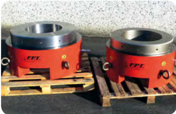
Special hydraulic tensioners external diameter 990mm and 830mm

The CTP series is characterised by the threaded interchangeable insert which makes it possible to work on studs with various threads, using just one hydraulic cell.